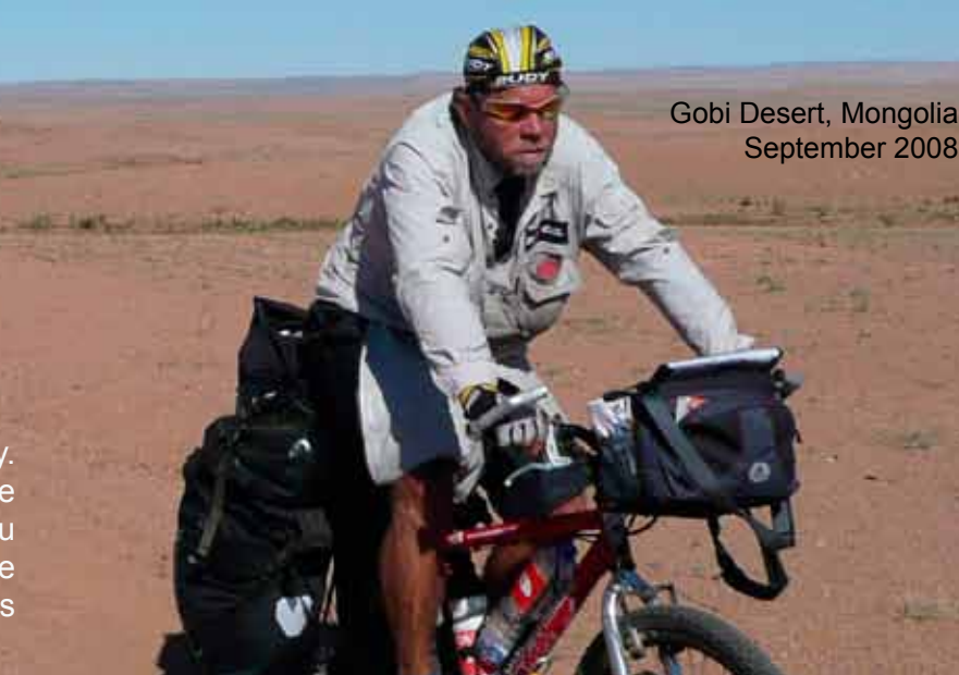
Gobi Desert, Mongolia September 2008